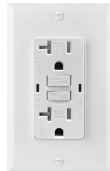
With Wall Plate