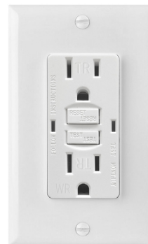
With Wall Plate