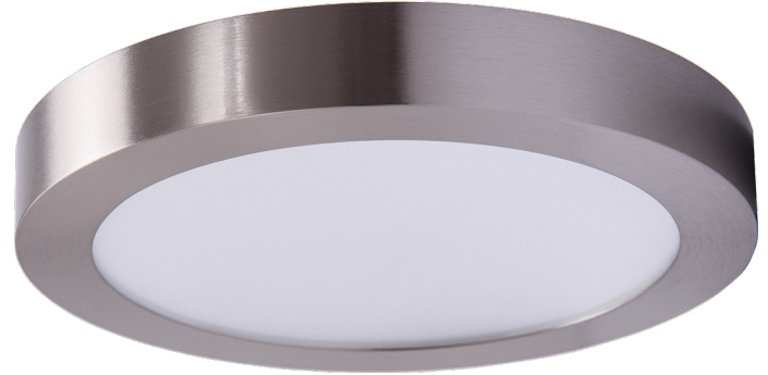
Shown with brushed nickel finish