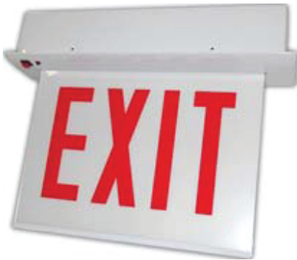
Wall Mount option is shown in image below.