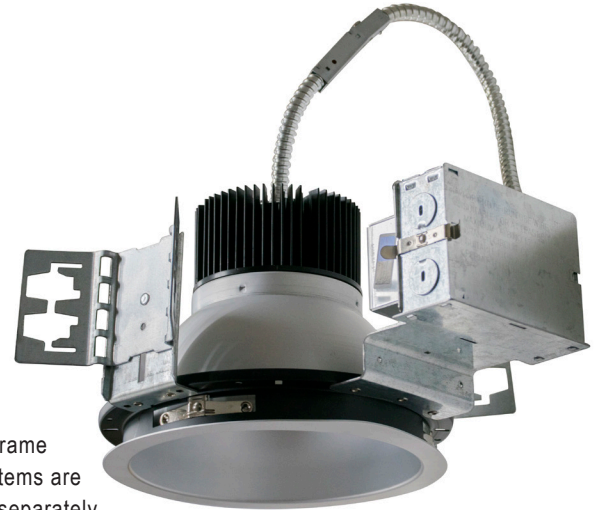
Trim & Frame shown. Items are ordered separately.