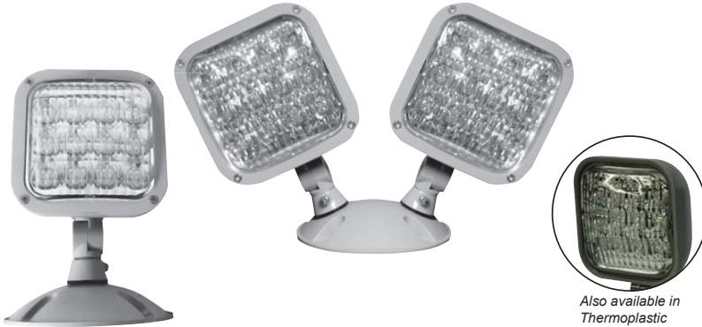
Also available in Thermoplastic