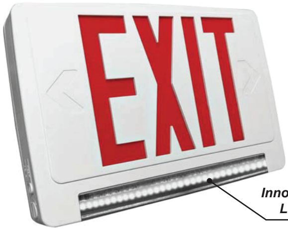
Innovative Compact Lightpipe Design